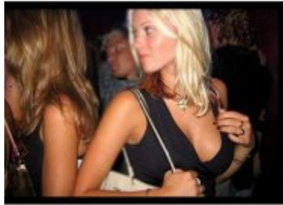
"The Rules" for Men!